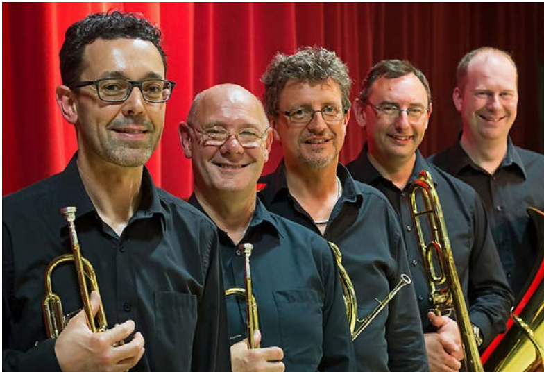
Prince Bishops Brass